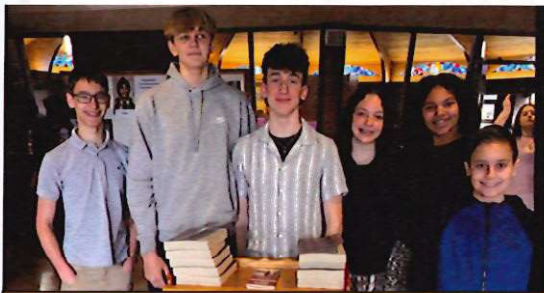
Who could resist such a warm, Good Shepherd Welcome, as this?