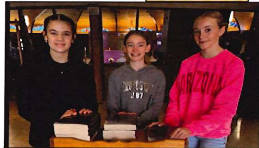
Thanks Edge students! Your presence here brightens our day.